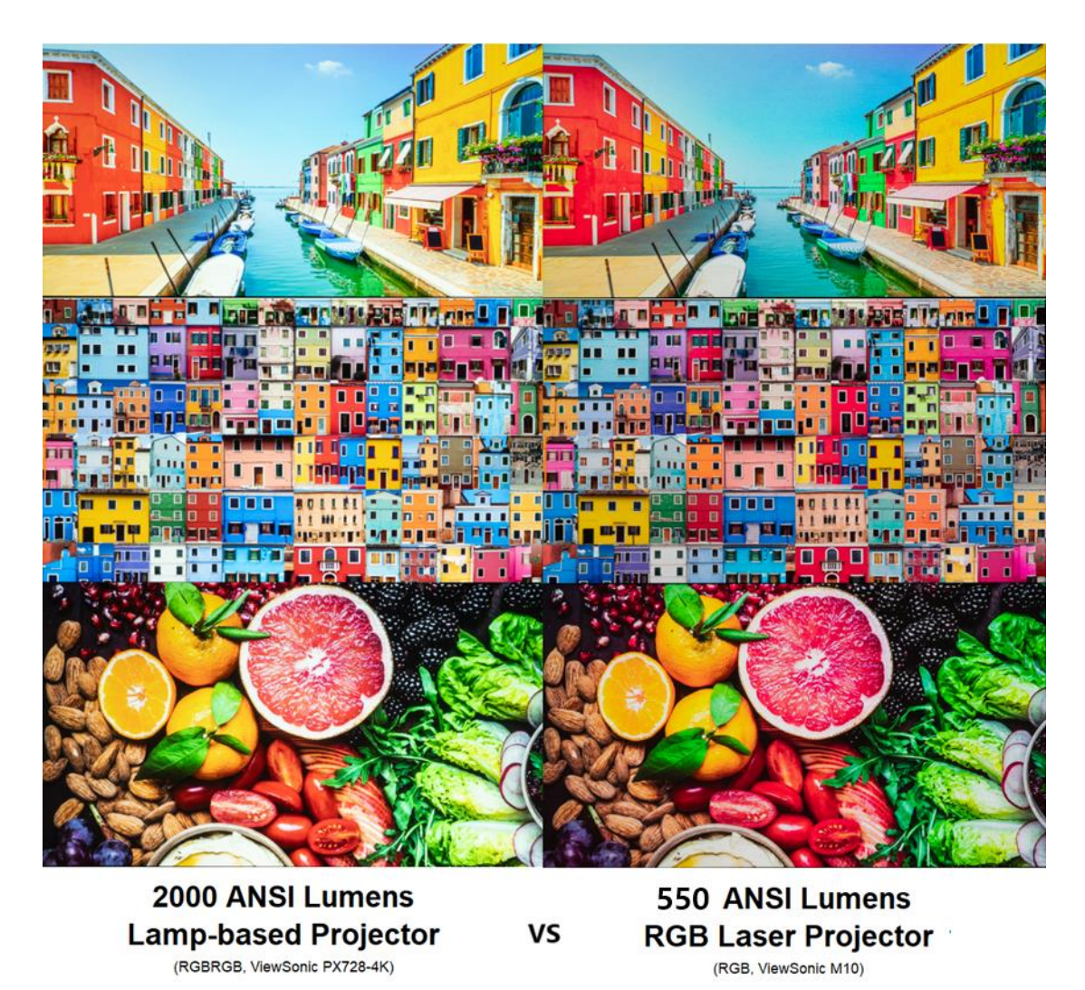
Figure 3. Sample image of a 2000 ANSI Lumens lamp-based projector (RGBRGB, ViewSonic PX728-4K) vs. a 550 ANSI Lumens RGB laser projector (RGB, ViewSonic M10)

Determining the typical Lumen specification for a given RGB laser projector first requires the selection of a lamp-based reference projector with an RGBRGB color wheel. The individual red, green, and blue light sources from the RGB laser projector are then adjusted until the perceived brightness closely matches that of the reference lamp-based projector. Another ANSI Lumens measurement of the adjusted RGB laser projector is then taken, and the ratio of these two measurements is multiplied by the ANSI Lumens measurement of the reference lamp-based projector to determine the equivalent "RGB Laser Lumens" rating.