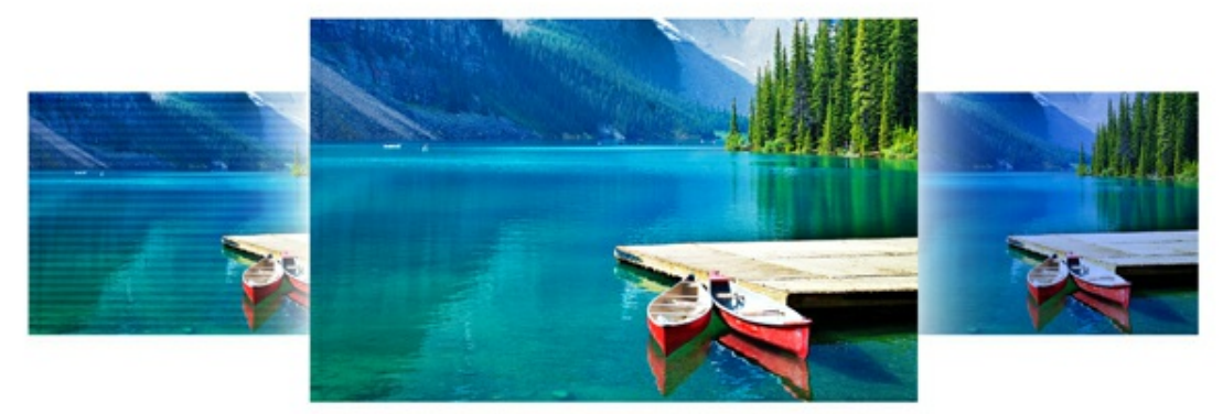
Blue light filter & Flicker Free