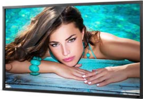
Full HD Resolution