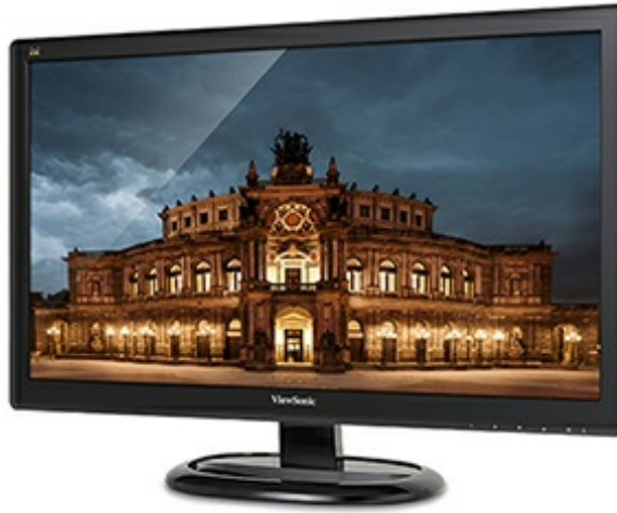
3000:1 Static Contrast Ratio