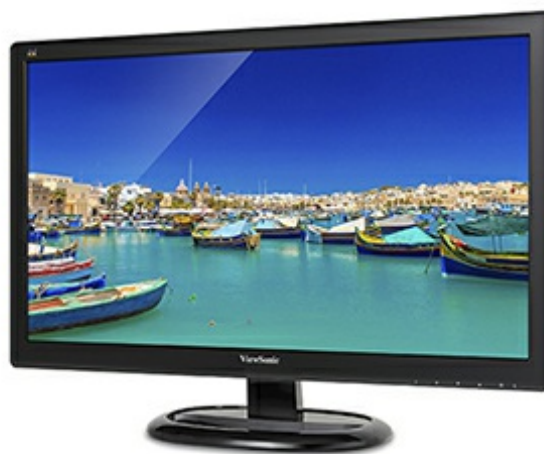
ViewSonic Flicker-Free Technology