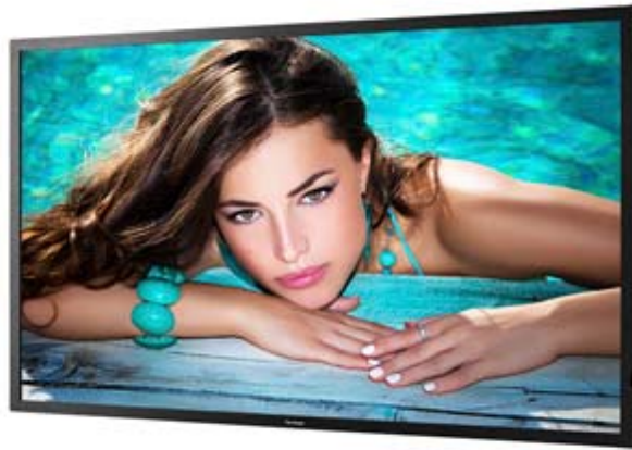
Full HD Resolution