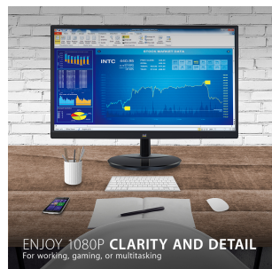
27" Full HD 1080p SuperClear® IPS panel with slim bezel design.