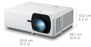
5000 LUMENS and Full HD (1920x1080) Resolution

Contact Sales ViewSonic.com 888.881.8781 email: salesinfo@viewsonic.com