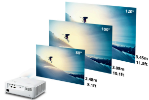
IMAGE SIZE AND PROJECTOR DISTANCE