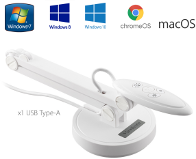
CONNECTIVITY AND COMPATIBILITY