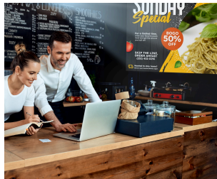
4,500 ANSI LUMENS And XGA resolution