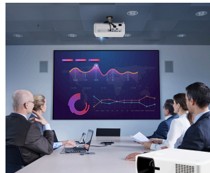
CRYSTAL CLEAR IMAGES In bright environments