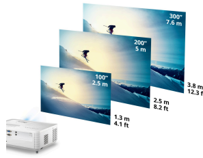
IMAGE SIZE AND PROJECTOR DISTANCE