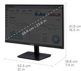
FULL HD (1920X1080P) RESOLUTION

Contact Sales ViewSonic.com 888.881.8781 email: salesinfo@viewsonic.com