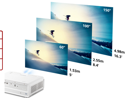
IMAGE SIZE AND PROJECTOR DISTANCE

*Can project up to 4.98m | 16.3' ** Ceiling mountable