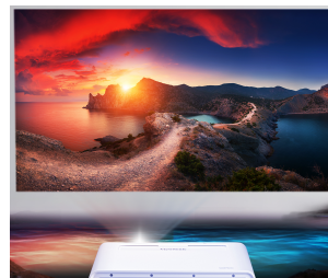
125% REC. 709 COLOR ACCURACY AND HDR CONTENT SUPPORT