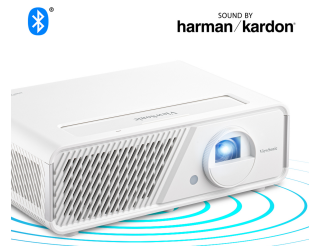
BUILT-IN HARMAN KARDON SPEAKERS