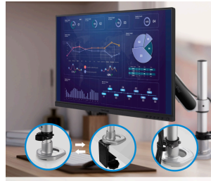
FLEXIBLE MOUNTING OPTIONS For Screens up to 32" and 22 lbs.