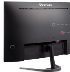
VESA Mount Compatible 2x 2-watt integrated speakers x2 HDMI 2.0 x1 DisplayPort 1.2 x1 Audio (Out)