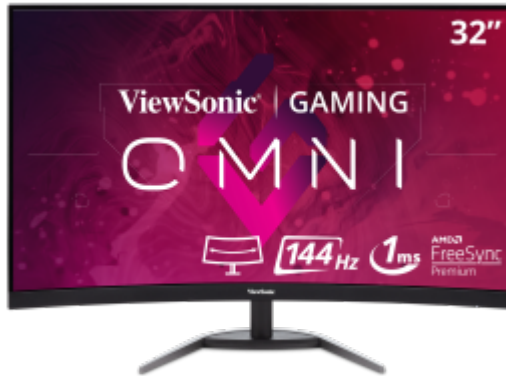
Future-proof inputs for flexible connectivity options