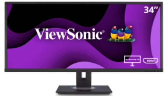
Future-proof inputs for flexible connectivity options