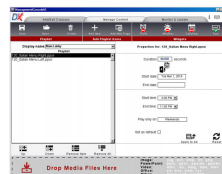
Step 2: Select Content to Play