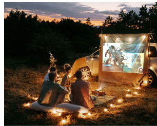
FULL HD 1080P PORTABLE LED PROJECTOR