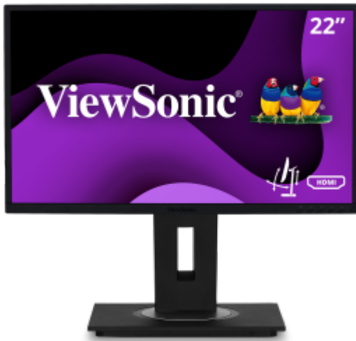
Future Proof inputs for flexible connectivity options