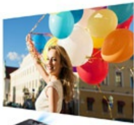
SuperColor™ projectors offer color accuracy levels