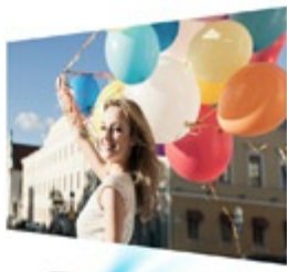
Conventional projectors offer low-quality images