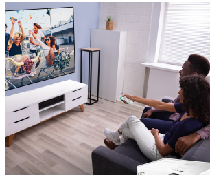
4,000 LUMENS AND 1080P RESOLUTION