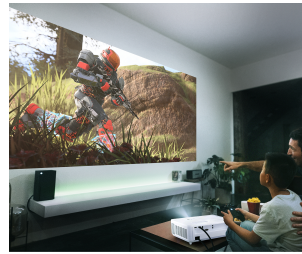
SEAMLESS GAMEPLAY 16ms Latency for Smoother Images

Contact Sales ViewSonic.com 888.881.8781 email: salesinfo@viewsonic.com