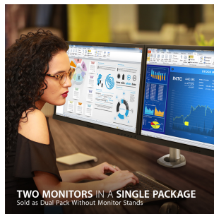
Full HD (1920x1080p) Resolution