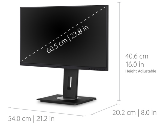
WQHD (2560x1440p) Resolution