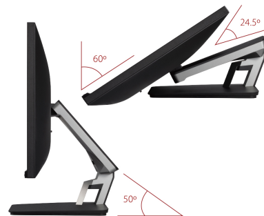
ADVANCED ERGONOMICS DUAL-HINGE DESIGN