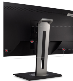
Future-proof inputs for flexible connectivity options