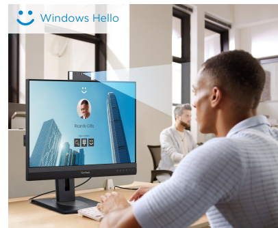
WINDOWS HELLO CERTIFIED Facial Recognition for Safe Single User Sign-On