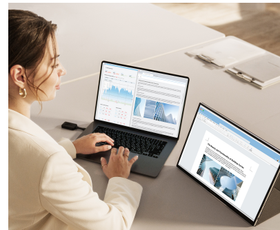
PLUG-AND-PLAY WIRELESS CASTING