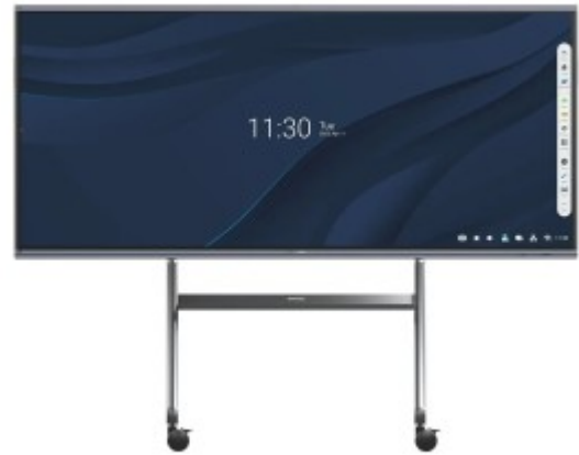
Mobile cart sold separately.