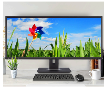
GREEN MEANS GO Paper-Based Packaging and Easy-to-Install Stand