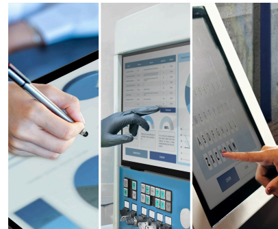
3 MODES FOR STREAMLINED EFFICIENCY Pen, Glove and Water-Resistant Touch Mode* *Only one mode can be used at a time