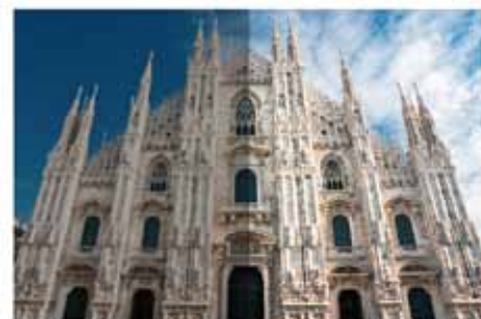
Normal 15,000:1 Contrast Ratio

The PJD7223 features 4,000 lumens brightness and a 15,000:1 contrast ratio to ensure the image will be crystal clear and vivid even in the bright environments. This feature allows the PJD7223 to adapt to various environments for greater flexibility in use.