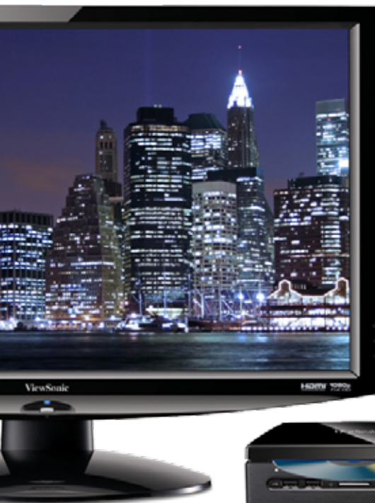
Monitor sold separately.

ViewSonic's VOT530 PC mini is an outstanding solution for downloading and managing digital content. Its powerful Intel® Core 2 Duo processor is just right for creating your own media and entertainment hub. This streamlined, space saving device is also eco-friendly – made with less plastic and saves up to 45% in energy usage.