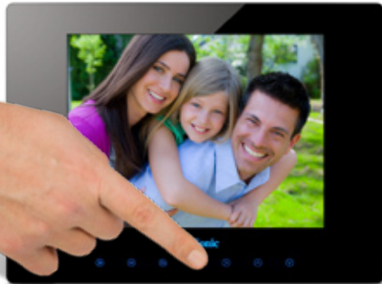
Touch controls activated.